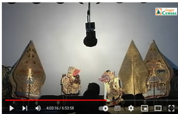
Fig. 1: The spirit of Kalabendana (right) is reminded by Narada God (left) to keep his promise to go to heaven with Gatutkaca.

In this scene it is told that the spirit of Kalabendana has been waiting for Gatutkaca for a long time. Kalabendana received the arrival of Narada God who reminded him that it was time for Kalabendana to immediately enter heaven (Figure 1). Kalabendana doesn't want to go up to heaven if it's not together with Gatotkaca. When he saw that Kuntawijayadanu's weapon released by Karna was barely strong enough to chase Gatutkaca. Kalabendana immediately came down from Swarga Pangrantunan and arrested him. While carrying the Kuntawijayadanu weapon, Kalabendana approached Gatutkaca (Figure 2). Gatutkaca remembers the mistake he made when he accidentally killed Kalabendana. Gatutkaca realized his death. He immediately opened the cinde belt his mother had given him, released all his strength, and showed his umbilical cord to Kalabendana. Gatutkaca's spirit goes to heaven with Kalabendana (Figure 3). Gatutkaca's body fell, destroyed Karna's chariot and destroyed hundreds of Astina's soldiers, including Wrestasena, Karna's son. Gatutkaca's death makes Bima angry. Bima killed almost all of Duryodhana's younger siblings, except for Dursasana.