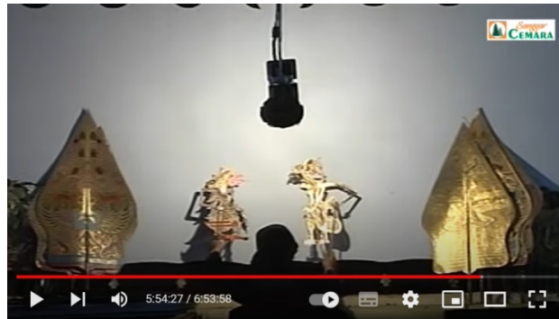
Fig. 5: Drupada (right) fulfilling his promise with Drona (left)

Let's complete your oath. When attacking Pancala State, you got Sokalima State from me and you made it an independent state. At that time, I was willing to take part of my territory, but I promised "in the future when there is a big war I will fight you, fellow students of Rama Parasu