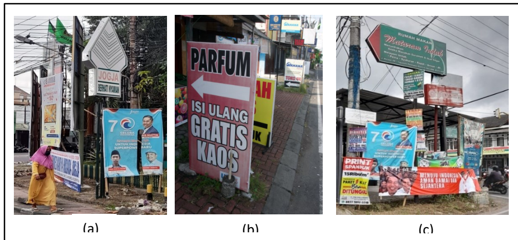
Fig. 4: Installation of billboards without permission and damage the beauty of the environment. (a) The sign/slogan 'Jogja has a Comfortable Heart' that does not match the slogan. (b) Public facilities (sidewalks) are covered with billboards. (c) Installation of banners, banners, signs/sign systems that are chaotic and overlapping

Physically, the placement of outdoor advertising media often disturbs the beauty of the urban environment (Borisova et al, 2017). In this context, the word 'space' is understood as a place that is the centre of attention for various interests. The advertisement placement space itself is not the only thing being targeted, but also because of the demand for 'aesthetic quality' which arises as a result of the changing behaviour and lifestyle of the people in urban areas. Hall et al. (2000) says that the high mobility of the population and the relationship between parts of the city result in parts of the city and urban spaces being frequently enjoyed by the citizens of the city. Talking about billboards is not only limited to promotional media, but also talking about urban planning which cannot be separated from its social and environmental aspects. Urban development and development activities are not only aimed at the convenience and security of the public but cannot be separated from the beauty or aesthetic aspects of the city and its environment.