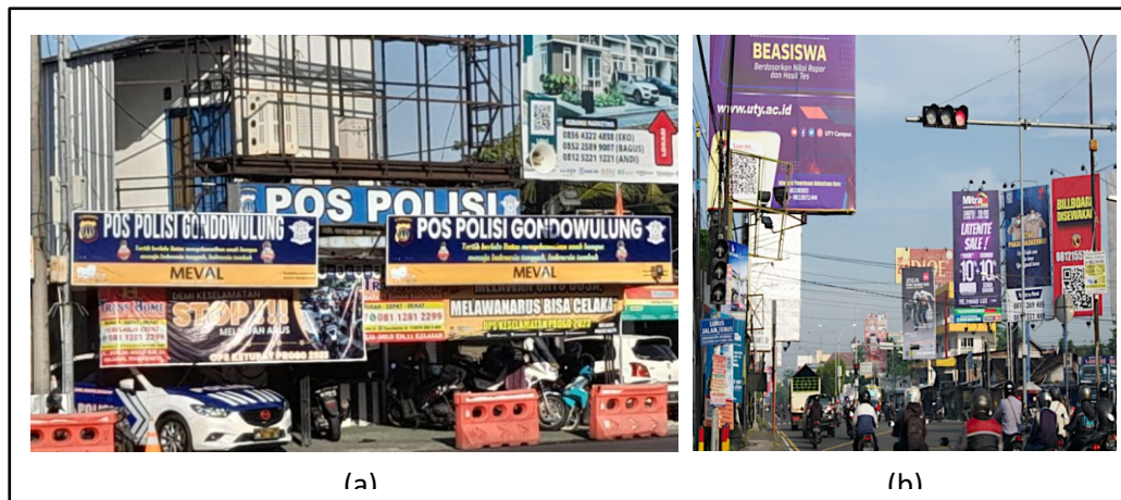
Fig. 3: Advertising media installed in public spaces. (a) The police station (b). The T-junction/crossroads

The presentation of visual data in the field as well as the interviews with several informants, confirmed that the placement of advertisements or billboards in Yogyakarta contained problems. The results of analysis in the field also show that the massive advertising in public spaces is spread out at various points/places. Most of them have been installed without permits, without heeding the ethics and aesthetics of the city environment.