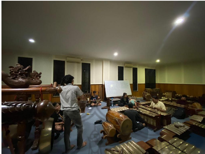
Gambar 17. Proses Latihan Karya Among