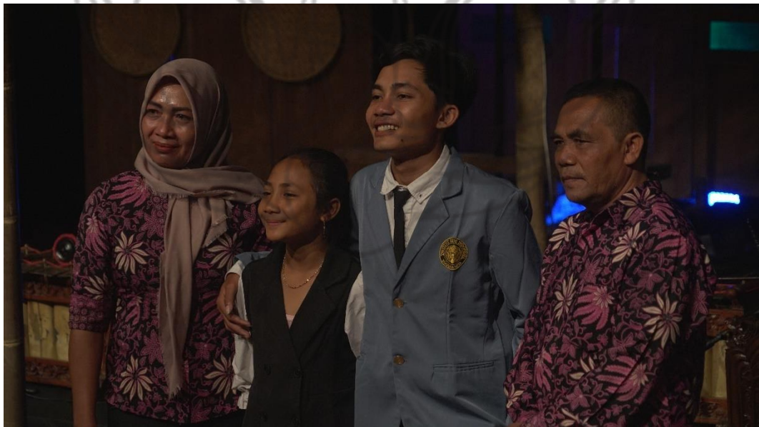
Gambar 18. Dokumentasi Bersama Keluarga Setelah Pementasan Karya Among