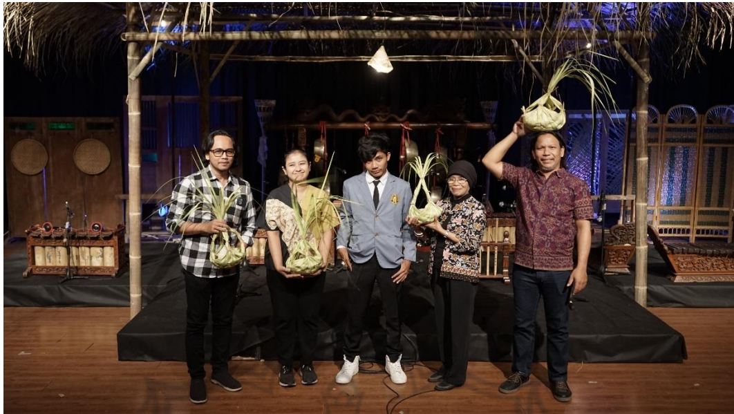
Gambar 17. Dokumentasi Bersama Penguji Setelah Pementasan Karya Among Foto : Muhammad Haris, 2023