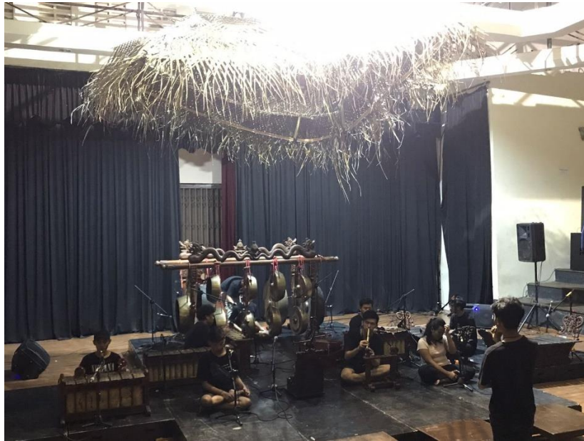
Gambar 19. GR Karya Among Foto: Retno Puji, 2023