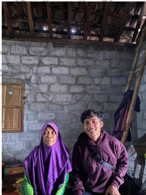
Gambar 14. Wawancara Dengan Dukun Bayi Narasumber Di Kanigoro Saptosari Gunungkidul