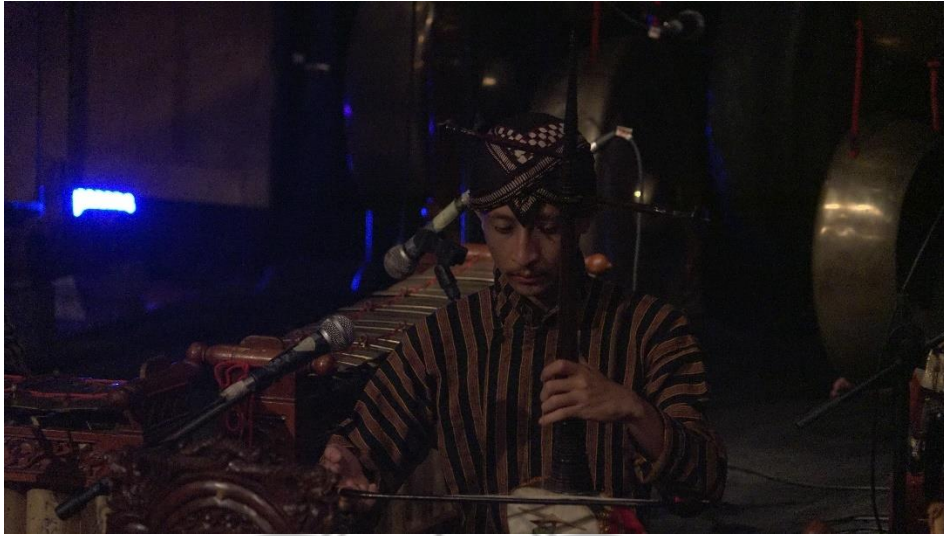
Gambar 13. Pementasan Karya Among Foto : Muhammad Haris, 2023