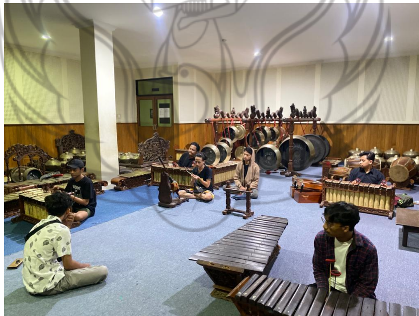
Gambar 16. Proses Latihan Karya Among