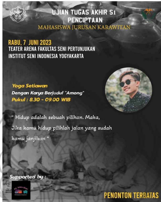
Gambar 19. Poster Pementasan Karya Among