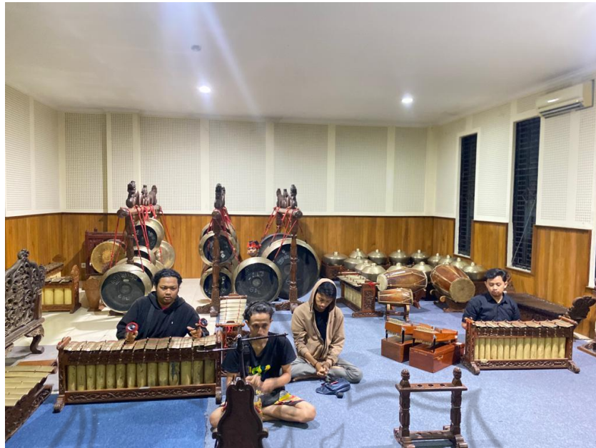
Gambar15. Proses Latihan Karya Among