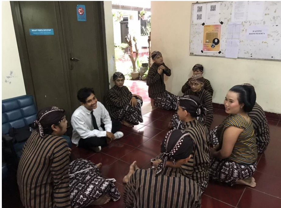
Gambar 11. Briefing Sebelum Pementasan Karya Among