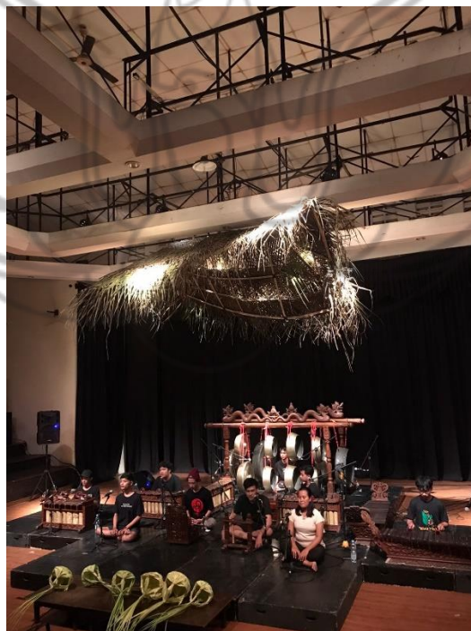
Gambar 20. GR Karya Among Foto : Retno Puji, 2023