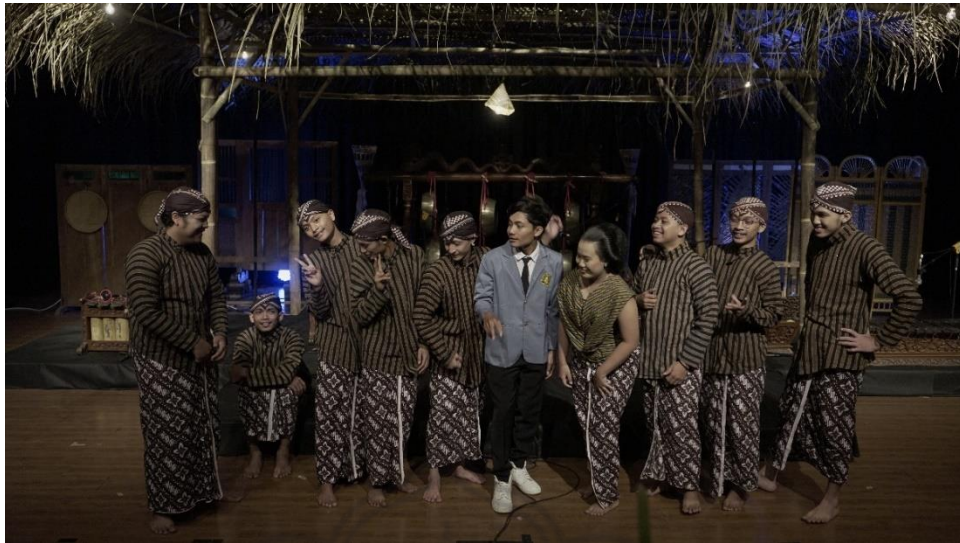
Gambar 15. Dokumentasi Bersama Pendukung Pementasan Karya Among Foto : Muhammad Haris, 2023