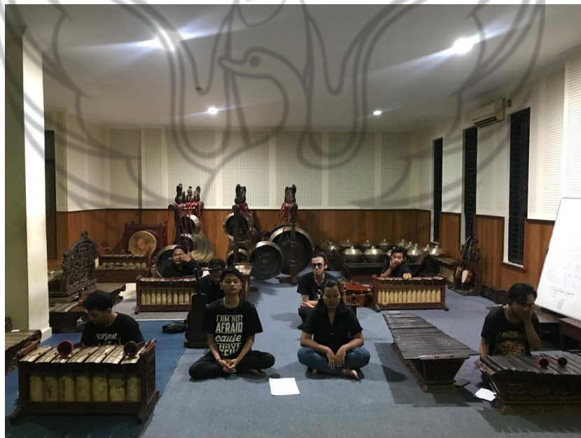
Gambar 18. Proses Latihan Karya Among