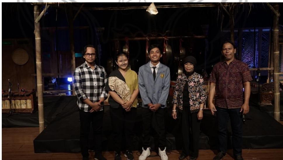
Gambar 16. Dokumentasi Bersama Penguji Setelah Pementasan Karya Among