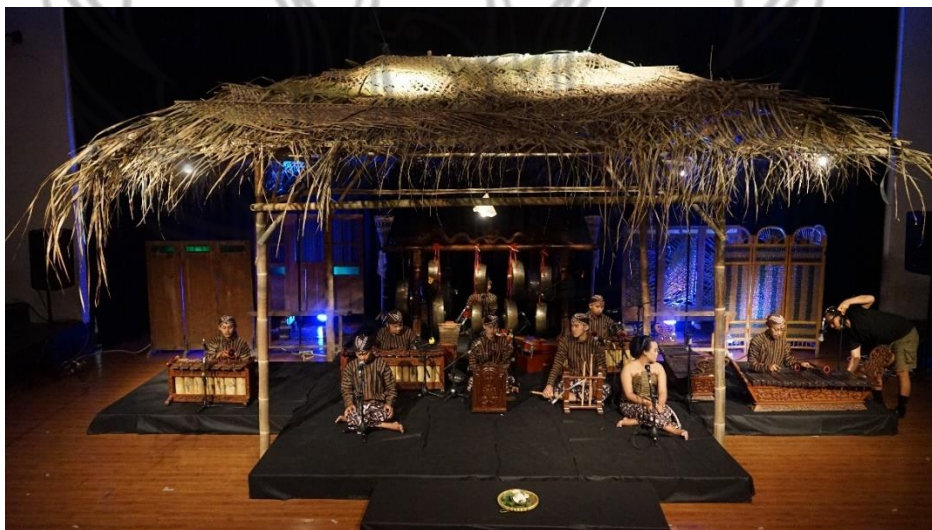
Gambar 12. Karya Among Foto : Muhammad Haris, 2023