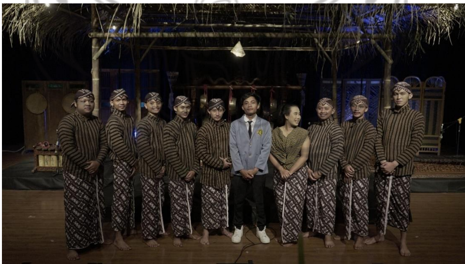
Gambar 14. Dokumentasi Bersama Pendukung Pementasan Karya Among