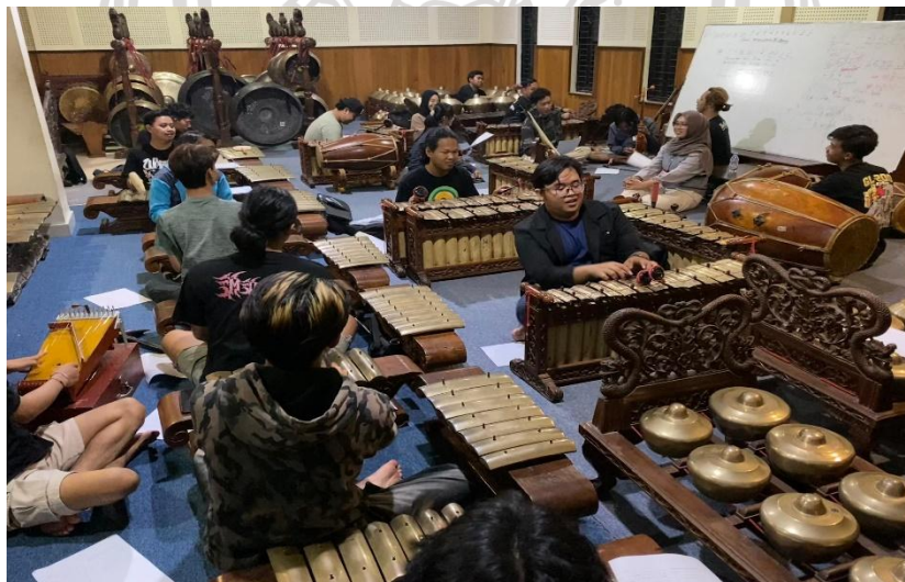
Gambar 4. Proses Latihan di Ruang Gamelan Goplo Jurusan Karawitan. (5 Mei 2026)