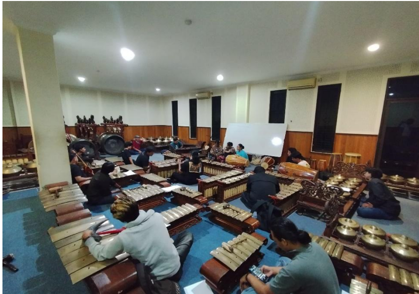
Gambar 5. Proses Latihan di Ruang Goplo Jurusan Karawitan. (Foto: Pratama, 15 mei 2026)