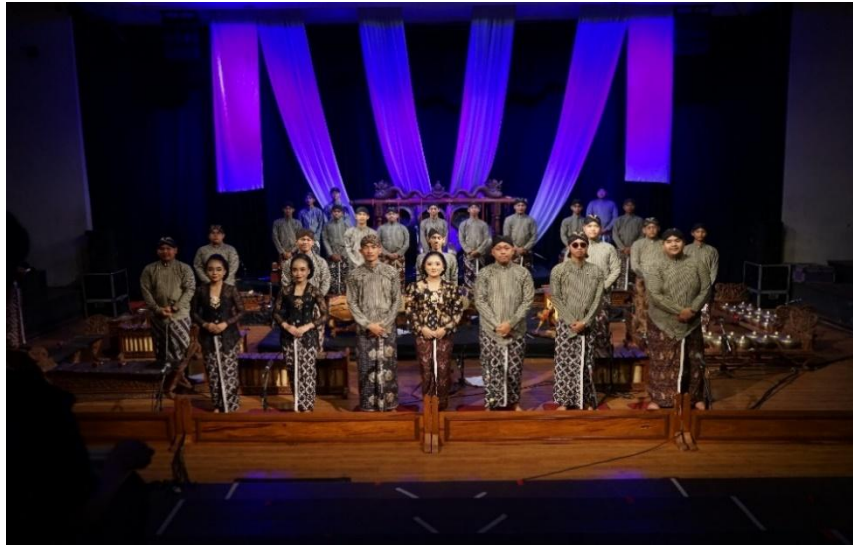
Gambar 7. Foto bersama pendukung tugas akhir ( Foto: Saputra, 20 Mei 2026)