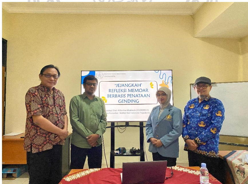
Gambar 8. Foto Pasca Ujian Pendadaran Tugas Akhir.