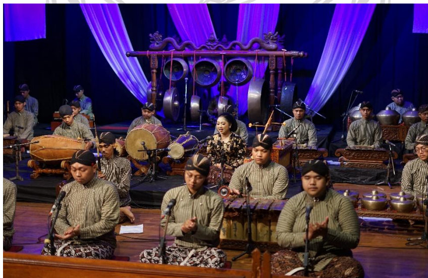
Gambar 6. Pegelaran Tugas Akhir (Foto: Saputra, 20 Mei 2026)